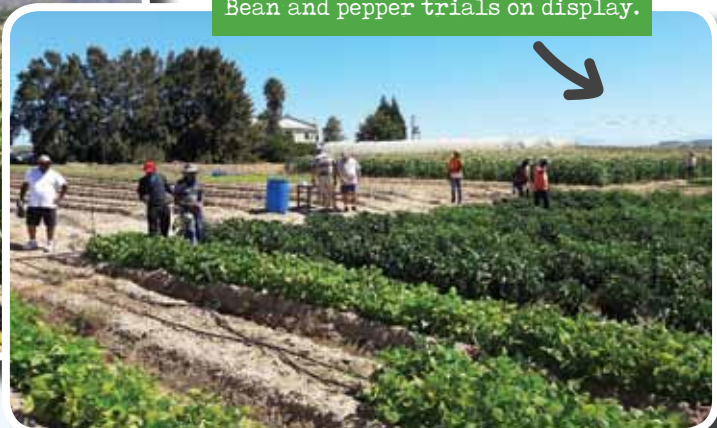
Bean and pepper trials on display.